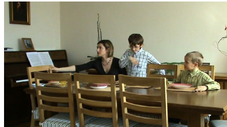
(b) Aga pushes back chair (line 5).