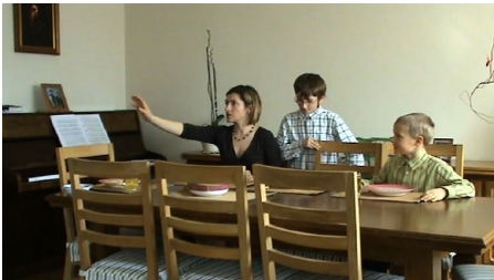
(a) Aga stretches out arm (line 3).