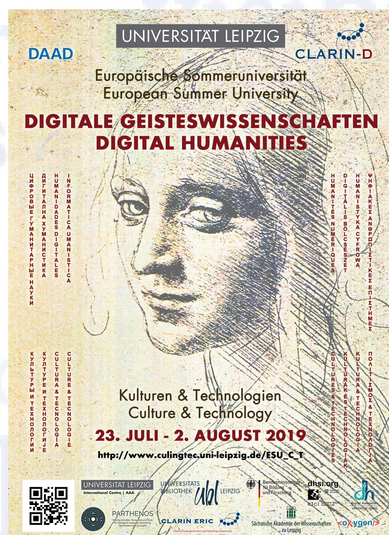
Poster of the European Summer University, 2019