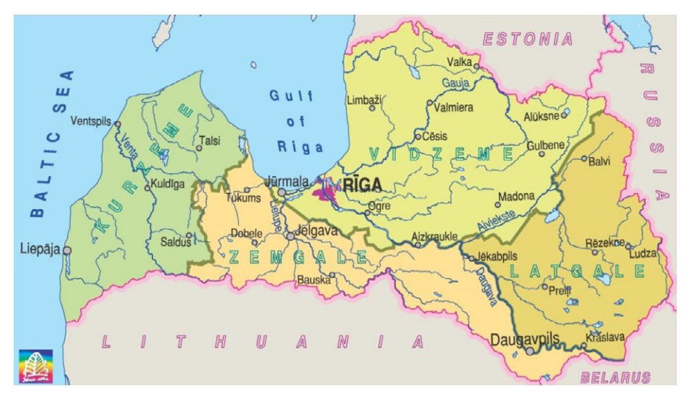
Map 1: Map of Latvia

Migration from Poland and Russia existed throughout the centuries, but it was not before the Soviet migration processes that non-Latgalian speakers in Latgale reached higher numbers and even outnumbered Latgalian speakers. In this, there is a large rural-urban division: Whereas most parts of the Latgalian countryside continue to be Latgalian-dominated until the present day, the cities are much more diverse, with non-Latgalians outnumbering Latgalians and Latvians in general in the biggest cities.