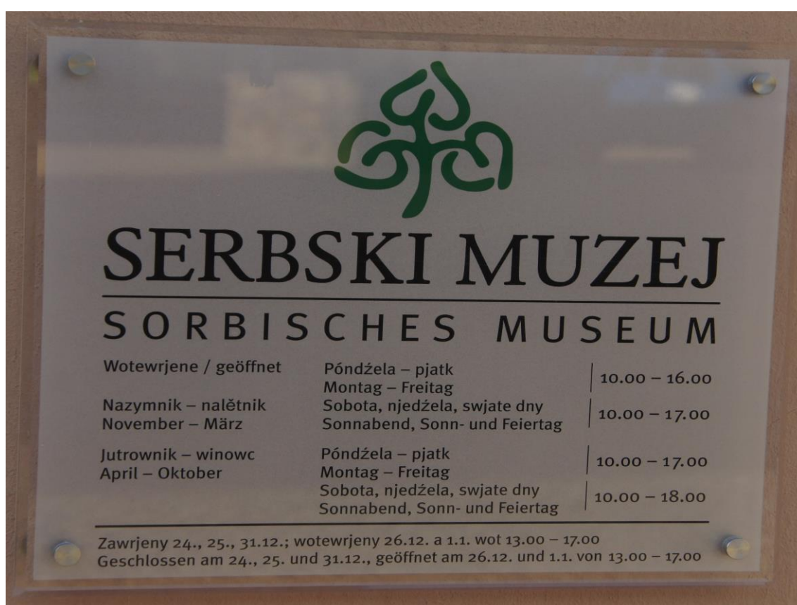
Figure 5. A rare example of a Sorbian-first bilingual sign.

As exceptions to the usual dominance of the German language we found relatively many signs in the offices of the Sorbian radio and TV services (which are part of the regional state media) and in the WITAJ kindergarten project administration. These were bilingual on a regular basis, and inside these institutions there were even some few instances of monolingual Sorbian signs. These were found, for instance, in the staircases of the Sorbian media offices, where the symbolic aspect of this measure was also stressed in the conversation with a local employee. It was also here where, in situations which may be labeled as semi-public such as on office notice boards, we encountered some of the rare situations where we saw Sorbian not just for symbolic purposes, but where the Sorbian texts contained more content, e.g. for exchanging information between employees or on internal work plans.