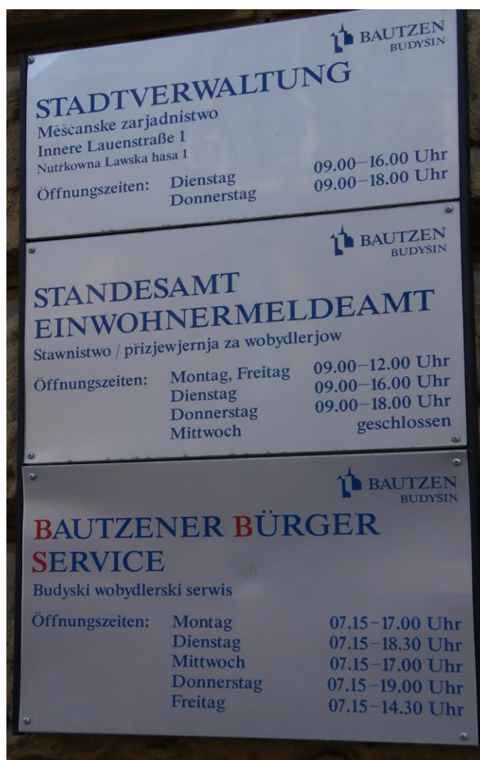
Figure 2. Symbolic and at the same time tokenistic presence of Sorbian at a municipal office.

The findings from the analysis of government signs in public space are confirmed when investigating web sites of state institutions in Budyšin. For instance, Sorbian features on the official sites of both the city of Bautzen ( www.bautzen.de , Figures 3 and 4) and of Bautzen County ( www.landkreis-bautzen.de ). Yet, the presence of Sorbian on the County web site is limited to a symbolic greeting and a bilingual name of the County (notably, also the web domains themselves have only German names). On the city web site, there is – in addition to the symbolic bilingual name of the city – more content in Sorbian, which is offered as one language alongside German, English, Polish and Czech. Yet, in contrast to the German page which features extensive categories on citizen services, information on the city’s history, information for businesses and tourists, the Sorbian version contains only a small proportion of the information given in German. Even with this limited presence of Sorbian, however, the city web site of Budyšin is one of the rare instances in the Web LL of mainstream institutions where Sorbian content is more than just symbolic.