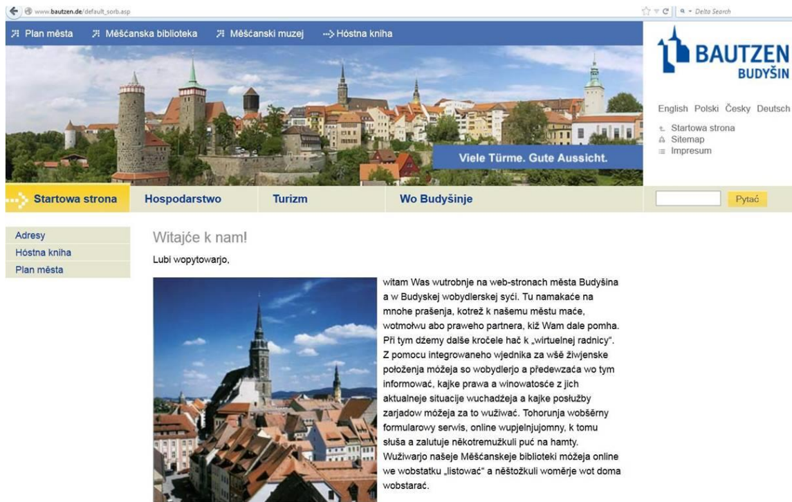
Figure 3. The official Web Site of the City of Bautzen in Sorbian.