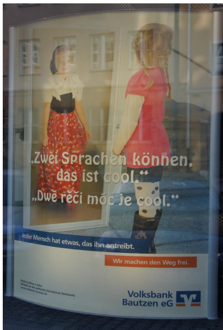
Figure 7. One of the few examples of a bilingual business advertisement (for a bank) – Sorbian being connected to tradition, German to contemporary life.

however, is again only in German, Figure 7). The poster shows a small girl who is looking into a mirror – in front of the mirror, she is wearing contemporary everyday clothes, in the mirror she is wearing a traditional Sorbian dress, blouse and headscarf. Even though this was a rare example where bilingualism and the advantages of learning Sorbian were promoted by a non-Sorbian institution, this picture shows also the clear connection of Sorbianness with tradition, whereas contemporary life takes place in German. When we inquired about the sign, however, an employee (ca. 60 years) in the bank did not even seem to understand our question and recommended to address the tourist information about Sorbian issues. Remarkably, this situation showed that even one of the few business institutions with a Sorbian sign did not seem to have a conscious policy on Sorbian which its employees would have been aware of. If possibly a speaker of Sorbian had been attracted by the advertisement and entered the bank, s/he would also be disappointed that there was no information and no signs in Sorbian inside the bank.