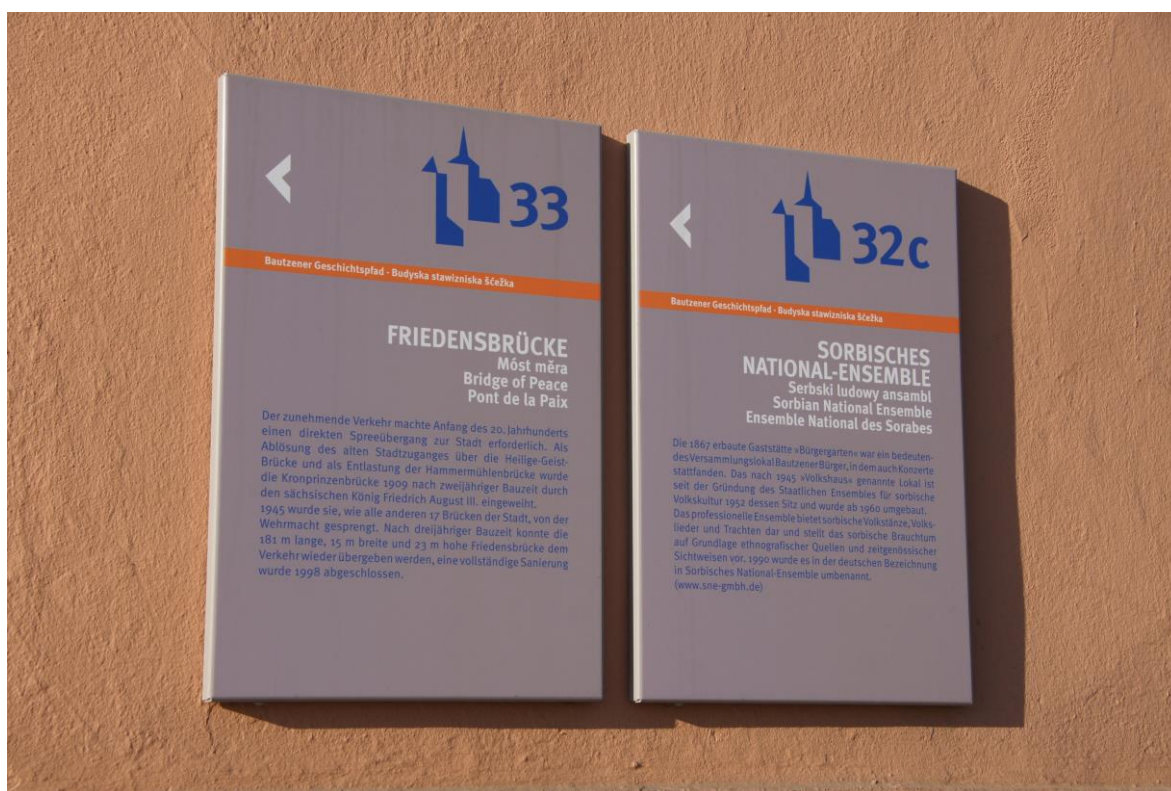
Figure 6. A quadrilingual sign for tourists, the main text being only in German.

not in detail. He added that Sorbian symbols are used by the city of Bautzen in touristic contexts, but that these were more important when representing the city outside the region, e.g. on tourism fairs in other parts of Germany. Our informant did not see any potential for tourism – or for economic development of the town in total – in the Sorbian language as such, only in its occasional symbolic use. In comparison to practices and perceptions in other linguistic minority regions (cf. e.g. Lazdiņa, 2013, on Latgalian in Latvia or Kelly-Holmes, Pietikäinen, & Moriarty, 2011, on Sámi and Irish in the Web LL), there was thereby a remarkable lack of using Sorbian for constructing local authenticity for touristic purposes, as well as a very limited level of commodification of the language or other Sorbian symbols (as reflected also in the products available and the attitudes expressed by employees in gift shops, book shops and other places which we visited during our research, see below). In the Bautzen Stasi Prison Museum / Memorial Site, an employee of approx. 35 years explained that he was not from the city and that the idea to address Sorbian issues in the context of his work had never occurred to him. Moreover, he interpreted our interest in Sorbian as an interest in historical projects on the Sorbs in the GDR or similar.