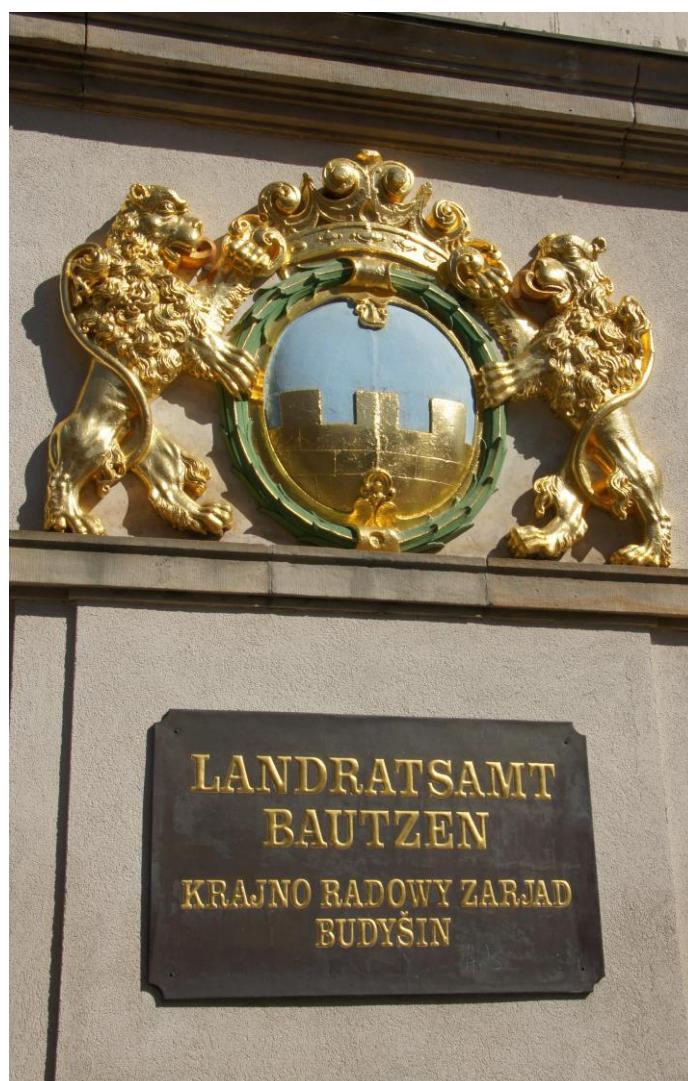
Figure 1. Highly symbolic presence of Sorbian at the office of Bautzen / Budyšin County.